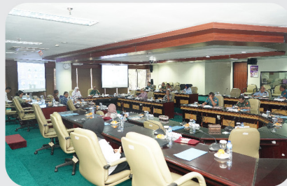
Lemhannas RI Discusses Potential Conflict in the Taiwan Strait