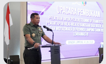
Training of Trainers in Lampung