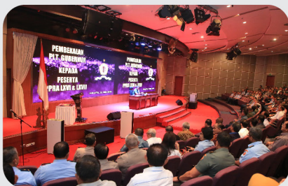
Acting Governor of Lemhannas RI Gives a Lecture to PPRAs 66 and 67