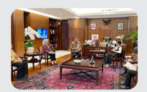
Acting Governor of Lemhannas RI Pays a Courtesy Call to the Indonesian Minister of Foreign Affairs