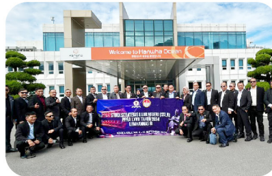
Being One of the World's Economic Pillars, South Korea Becomes an SSLN Destination