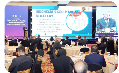
Lemhannas RI Hosts Jakarta Geopolitical Forum VIII/2024