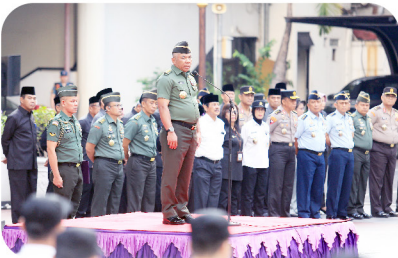
Acting Governor of Lemhannas RI Leads Flag Ceremony of September